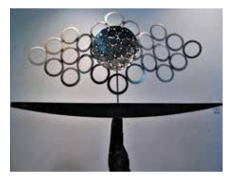
MOONLIT SAILS Stainless steel with bluestone base $5,500

CONTACT: gagrinbergs@yahoo.com Gintsgrinbergs.com 617.335.6899