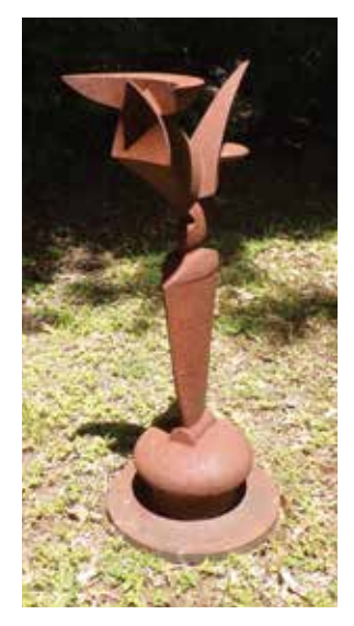
UNTITLED Painted fabricated steel Price upon request

CONTACT: stuffzilla@comcast.net 603.382.6271