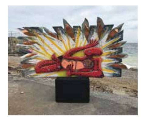
FIRE FROM THE SKY Wood, plexiglass, aluminum sheeting, acrylic paint/ polyester finish $5,000

Rangan's sculpture, "Fire from the Sky," is triggered by the war in the Ukraine perpetrated on civilians. "This sculpture depicts a mother trying to shield her baby from an exploding bomb," the artist explains.