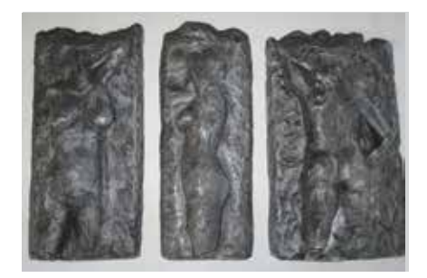
THREE SIDES OF JOJO Cast aluminum $3,500 for all $1,300 each