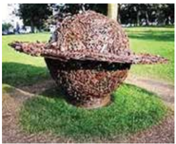
SATURN (SADTURN) Recycled and found materials $30,000

CONTACT: james@jameskitchen.com jameskitchen.com 413.537.5707