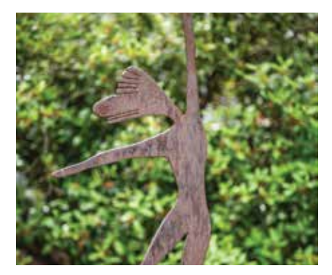
Dancer Artist name unknown