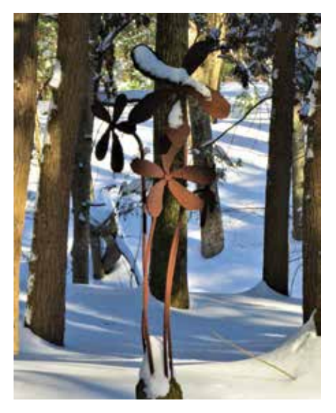
FLOWERS FOR UKRAINE (SLAVA UKRAINI) Broken concrete road post and rusty rebar $2,200