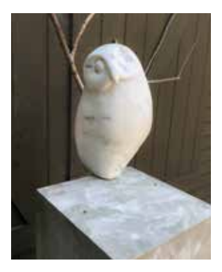
NIGHT WATCHMAN Marble and bronze $15,000

"As a sculptor who works in both stone and bronze, I wanted to create a piece combining both media," she says of "Night Watchman." "The barred owl came first, then I had to scour the woods for an appropriate 'tree'. It is a solid cast so could not be too massive or too spindly. I think I found a happy medium!"