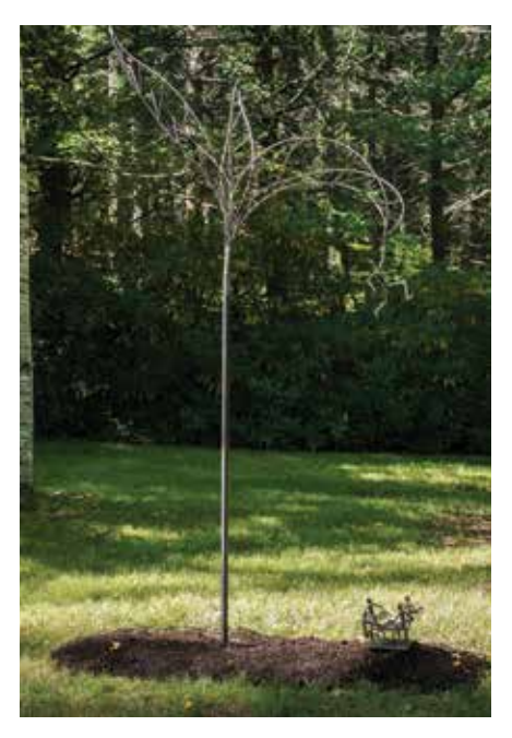
SAFETY NET Painted steel, stainless steel mesh $4,500