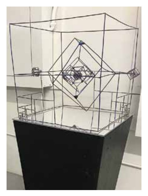
FRACTAL KINETIC SCULPTURE Anodized titanium $1,500