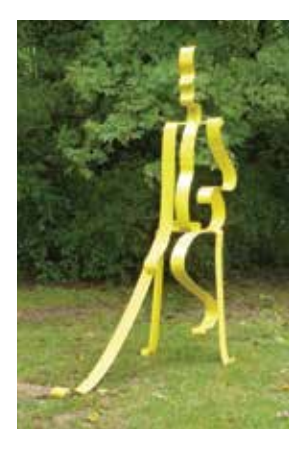
DISTANT Steel and paint $9,000

CONTACT: phil@philmarshallstudio.com philmarshallstudio.com 508.410.0070