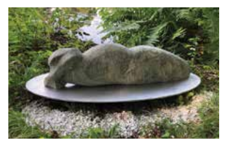
FOREST NYMPH Vermont Rutland marble on aluminum disk $4,200

"Forest nymph, descended from the Greek nymphs, is a personification of nature," explains Zibit. "A spirit, not necessarily immortal, but longer lived than a human.