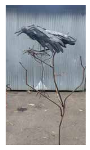
THE GATHERING Steel and bronze $1200

CONTACT: wtweedyc598@gmail.com 617.652.1666