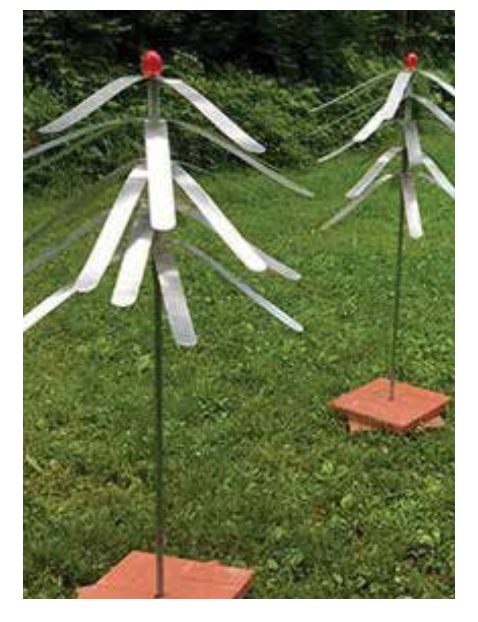
WINDWAVE GROVE Metal $400 each

CONTACT: MorningWoodFire@gmail.com 603.568.6749