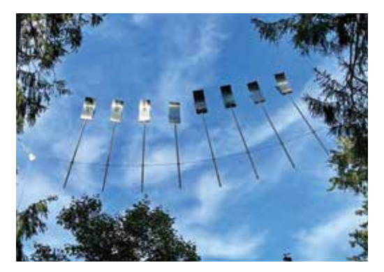
MURMURATION Aluminum pipes, lead rods, aluminum sheet metal, hardware, steel cable $3,000

CONTACT: jfix@comcast.net joefixsculpturecom 978.973.2366