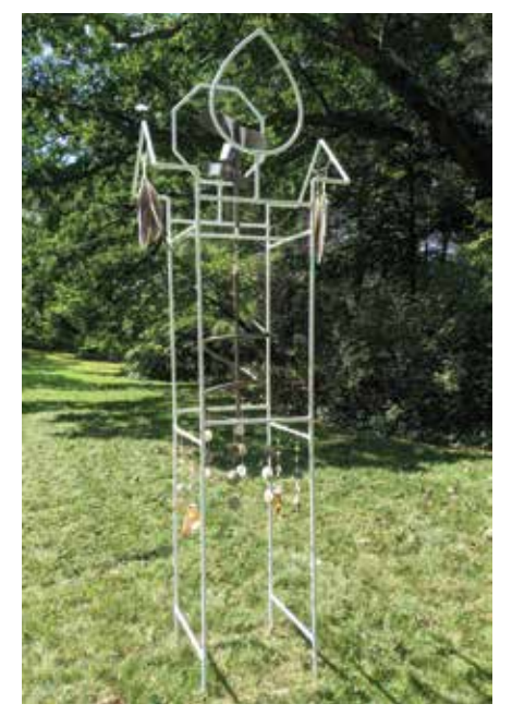
WIND ELABORATOR 2 Painted copper, sand dollars, feathers, seashells $4,500

CONTACT: jaz@joyceaudyzarins.com | Joyceaudyzarins.com | 978.270.3258