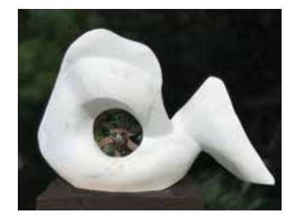
MOBLY Marble, Iron, and Glass $1,800