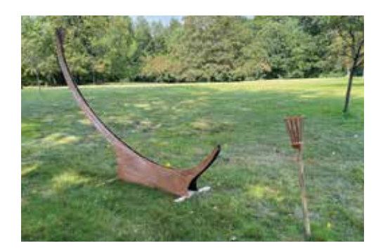
LEAP OF FAITH Plywood, wood epoxy NFS

"Leap of Faith" is an interactive piece that invites viewers to see if the ball will make the jump. "It won't every time, but with a little experimentation, you can tweak it into behaving a little