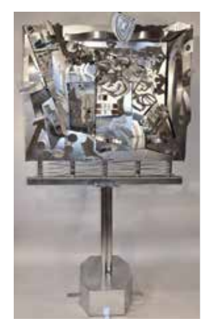
HOT STILL SCAPE IN 3-D Plate steel, steel rods, wire mesh $17,500

CONTACT: allenmspi@theothermanofsteel.com theothermanofsteel.com | 617.620.1443