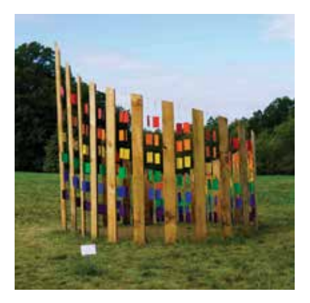
SINGING RAINBOW — REACHING Pine planks, plywood, string, steel cable, paint $500

CONTACT: pikemid@verizon.net 978.774.1507