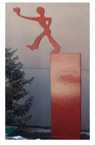
FOLLOW YOUR HEART Painted plywood, polypropylene $3,500

CONTACT: martwork8@gmail.com Markwoleyart.com 401.241.5947