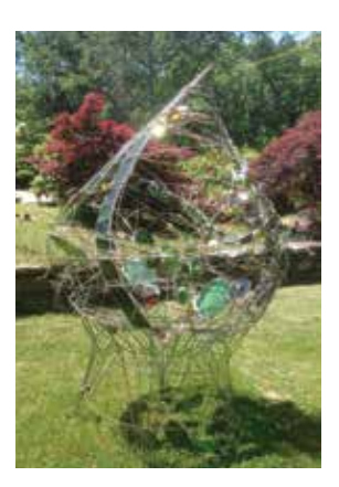
TSUNAMI Glass and metal $45,000

CONTACT: Joe@4fergs.com josephferguson.com 781.893.4273