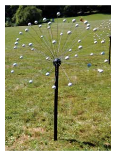
DANDELION SEED Reused golf balls, reused safety cable, a Bocce ball, PVC pipe $400 each