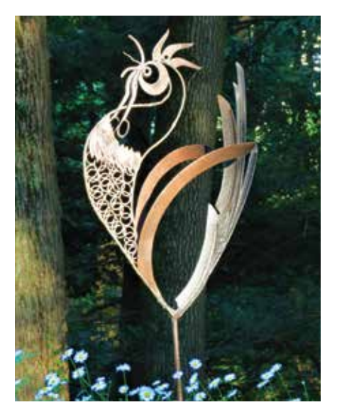
BLACK ROOSTER Welded steel and found objects $3,500