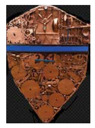
SHIELD OF HEROES Scrap metal $6,000

CONTACT: wllsmthk72@yahoo.com willsmithcabreraart.com 617.756.8951