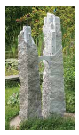
"KINGDOMS IN PEACE" Granite and Bluestone $6,500

thomas@greenart.com Thomasbergersculpture.com 207.438.7700