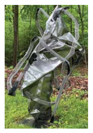
IMMUNITY Stainless steel, rocks, tar $2,000

CONTACT: madilord@yahoo.com | Madeleinelord.com @madeleinelordmadimetal | 617.480.7230