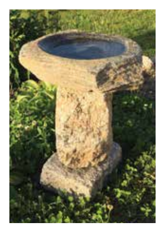
BIRD BATH Granite, metamorphic stone $1,495

CONTACT: andrew.mintz@verizon.net Whitepondfarm.com 978.897.6262