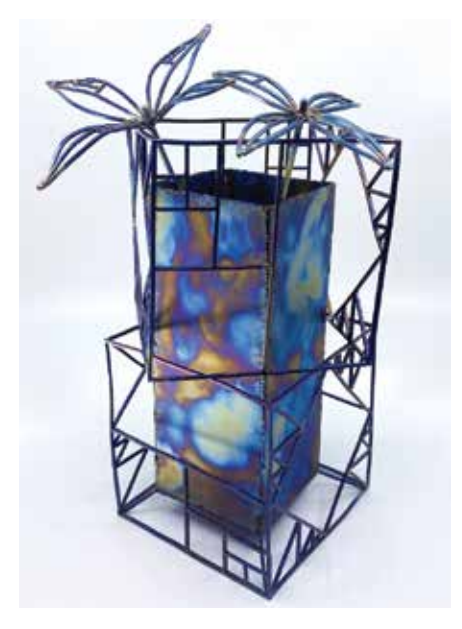
LARGE FRACTAL VASE WITH FLOWERS Anodized titanium $2,500

CONTACT: ikrepchin@gmail.com ilanakrepchinsculpture.com 617.852.8562